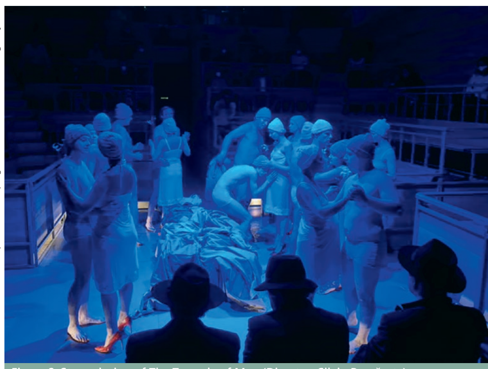
Figure 2. Stage design of The Tragedy of Man (Director: Silviu Purcărete)

leading to the premiere, which was sometimes paved with obstacles, is provided in the dramaturgical diary published on the pages of What is Theatre for? , as part of the third genre and structural unit of the volume, detailing the most important moments of Purcărete's canon of forms.<sup>5</sup>