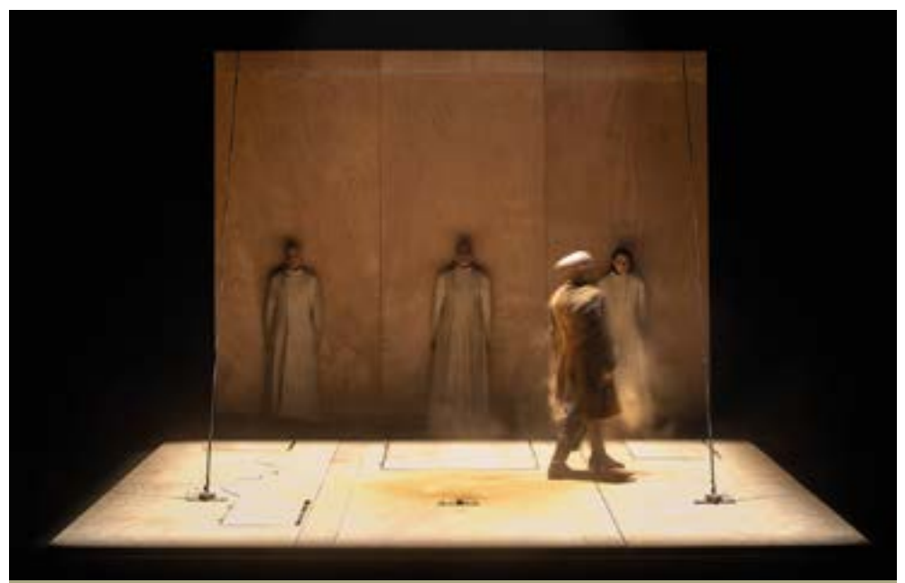
Picture 1. Stage view from Alessandro Serra's production of Tragùdia

and agitated nature of the performance. The Gesamtkunstwerk-type artistic vision of the performance offers a unique experience that intensely engages the senses and the imagination of the audience.