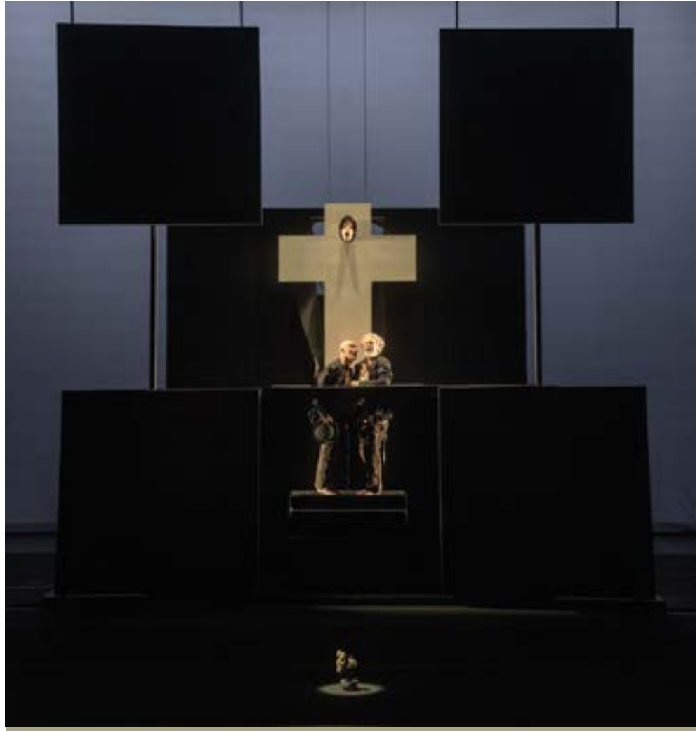
Picture 1. Scene from the National Theatre's production of Waiting for Godot (Director: Theodoros Terzopoulos)

of reality, the composition of physical and virtual realities in media spaces, Ungvári Zrínyi 2011, 123). Thus, places and events that were not previously within the domain of traditional rites have the chance to become rituals.