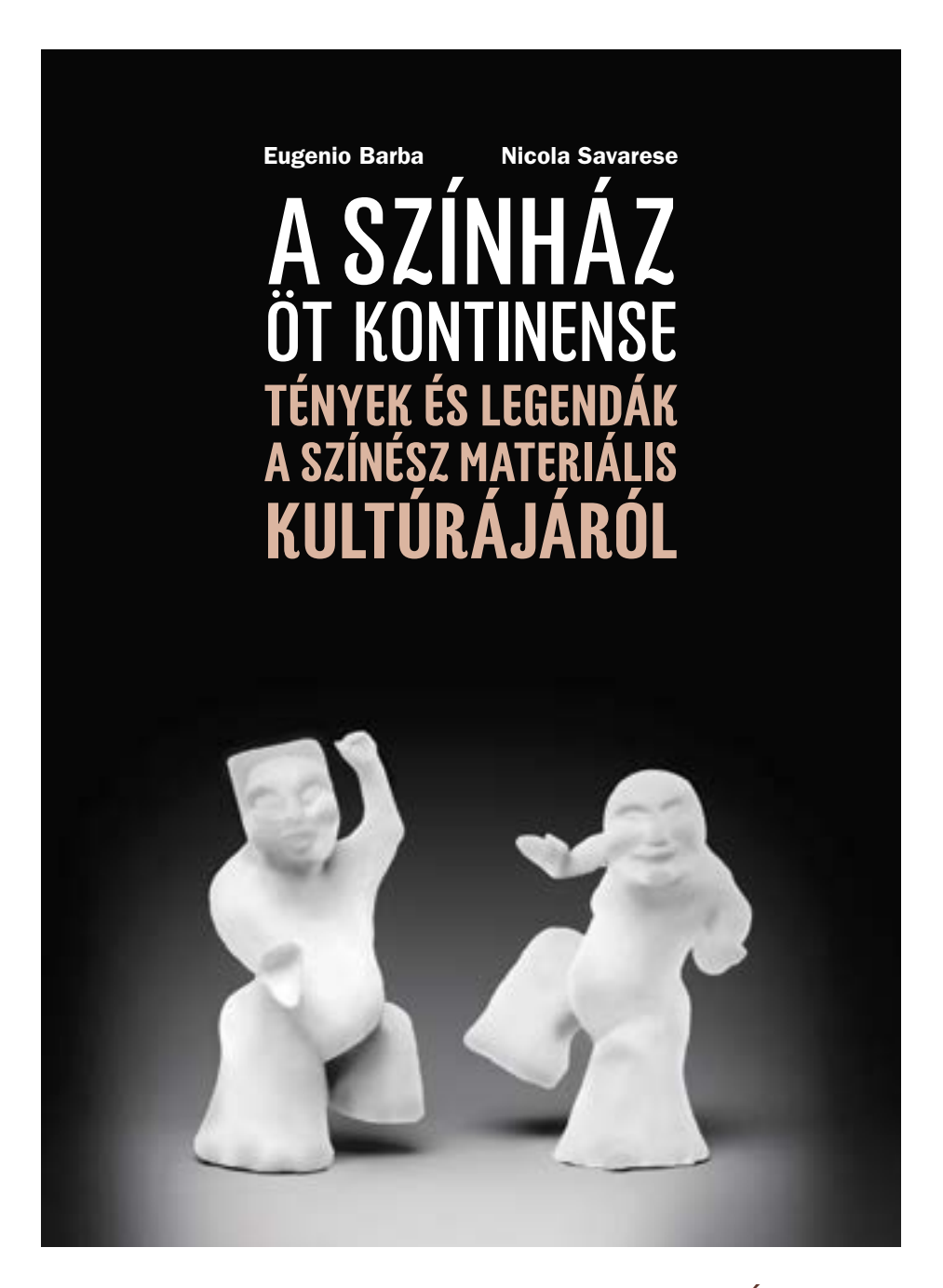
The book can be purchased in The Writer's Bookshop (Írók Boltja)